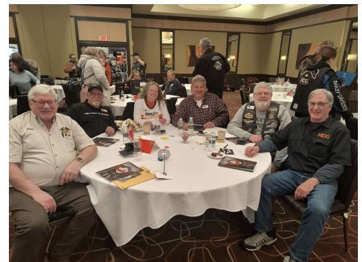
Chapter officers attend training session