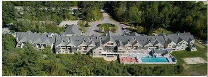
Grand Summit Hotel at Attitash Bartlett, New Hampshire

2025 IRON ADVENTURE RALLY Save The Dates – August 21 to 24, 2025