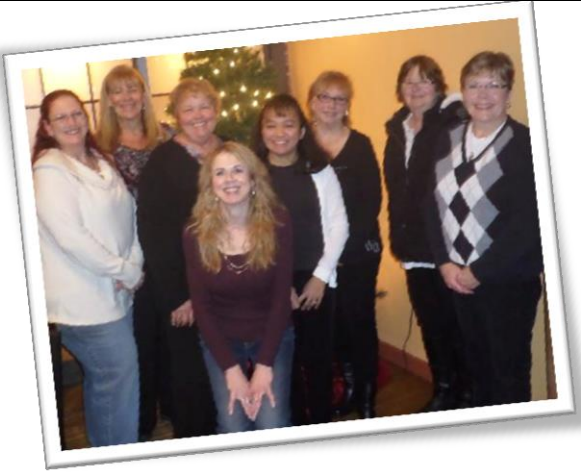
Annual Ladies dinner at DaVinci's