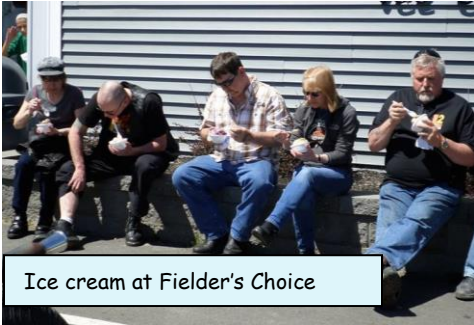
Ice cream at Fielder's Choice