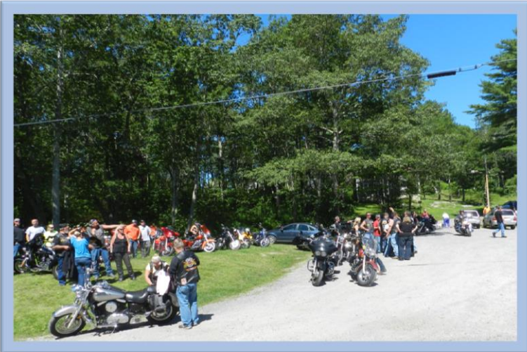
Aug.11, 2013 Ride to Texas Roadhouse in Augusta, Boothbay Harbor Park and Montsweag Roadhouse in Woolwich and back to Lewiston area. (The local H.O.G. group broke off from the main group and went to lunch at Montsweag Roadhouse, instead of going on to Gardiner with the horde).