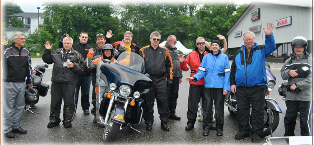
Ride to Rockport, MA