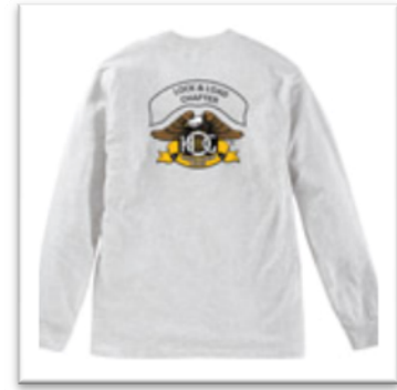
Long Sleeve Chapter T-shirt, heather grey $25 + tax and s&h