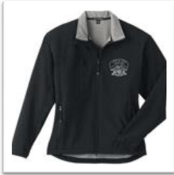
Men & Women's Chapter Jacket - $79 + tax and s&h