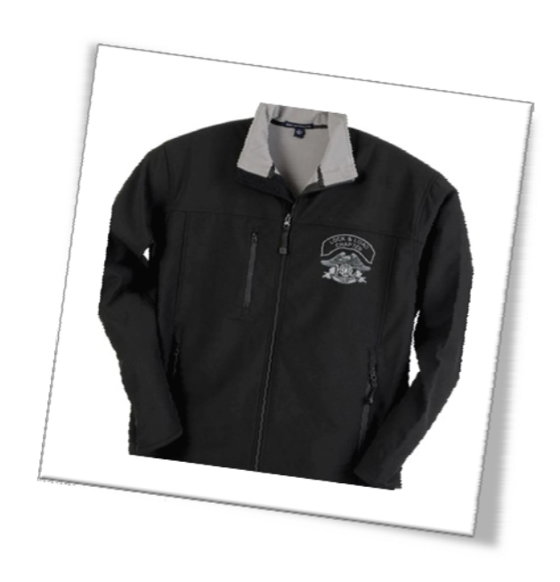
Men & Women's Chapter Jacket - $79 + tax and s&h