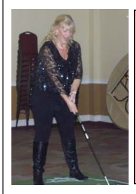
Billiards, Golf, Door Prizes