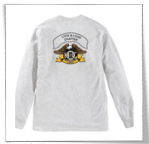
Long Sleeve Chapter T-shirt, heather grey $25 + tax and s&h

Also available but not shown – Short Sleeve 3-button Henley, heather grey - $26 + tax and s&h