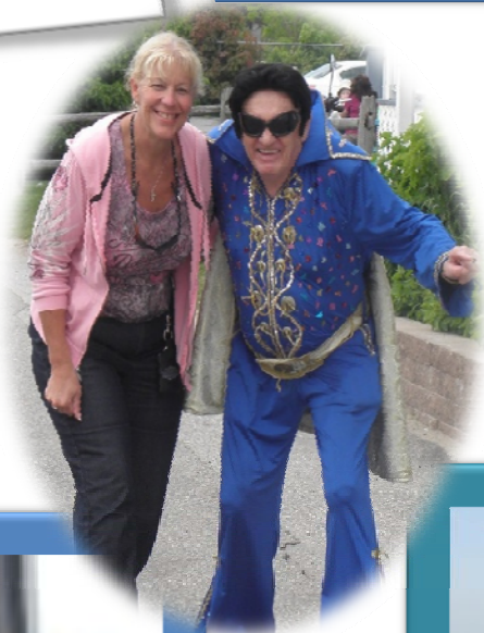
Elvis at Old Orchard Beach?