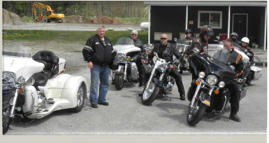
Photo taken on our first official ride of the season...