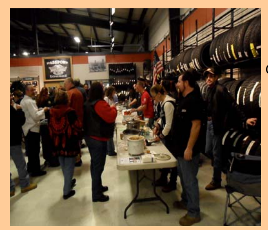
Chili and chowder entries