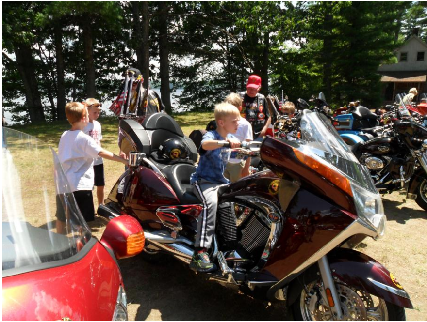
Trying on for size