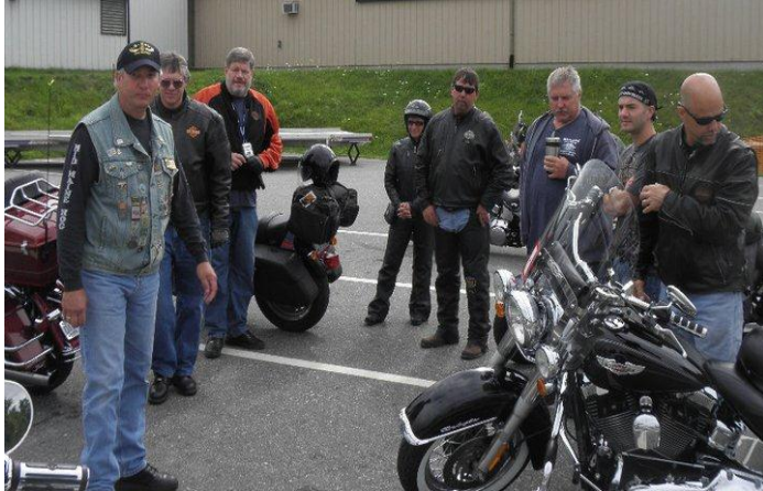
Getting ready to leave for the rally