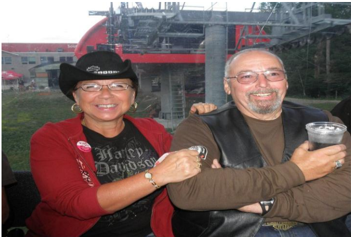
Chondola ride to the top and then a toast!