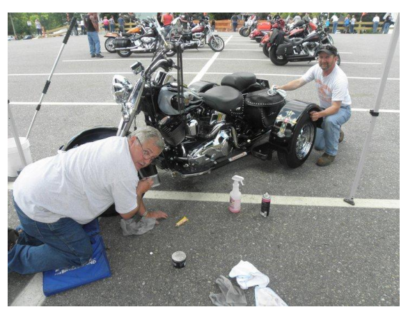
Family Day at LA Harley