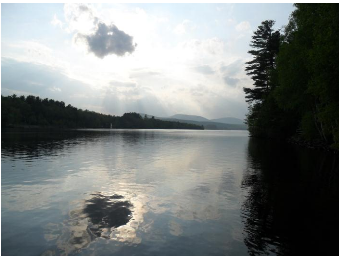
View at the head of Wilson Lake in Wilton (Franklin County)