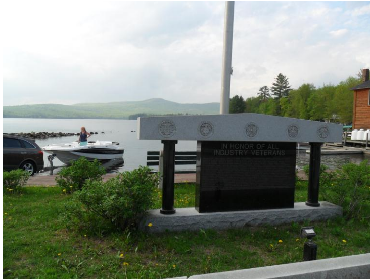
At the lake in Winthrop (Kennebec County)