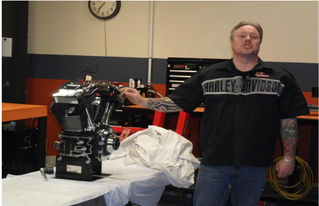
The Dyno room!