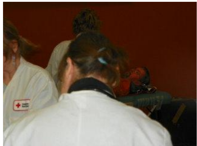
A willing donor...