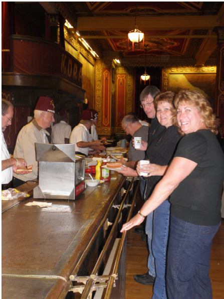
Members in line for a yummy dinner!!