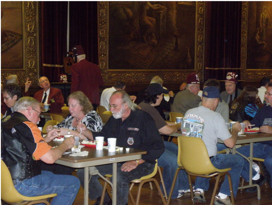
Great Company had by all!