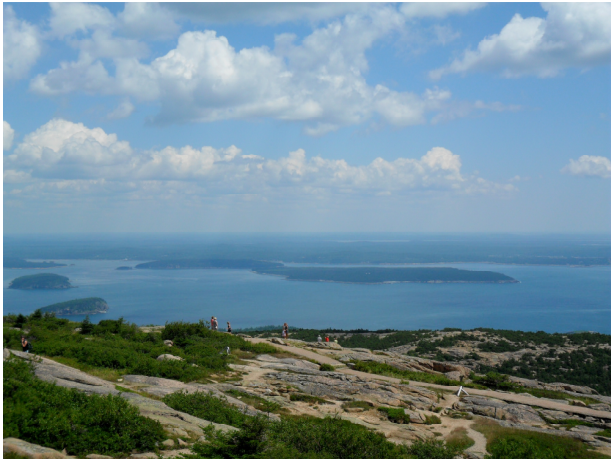
Look at the view that our members were treated too!