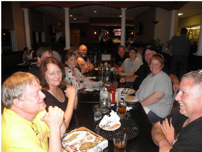
Enjoying friends and dinner at Angela's in Freeport. Wednesday Night Dinner Ride at its best.