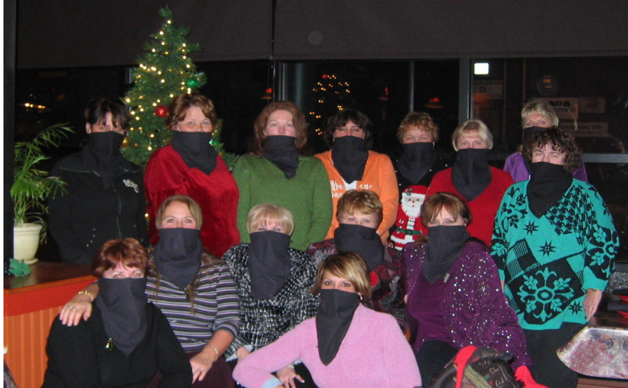
LOH CHRISTMAS DINNER!!