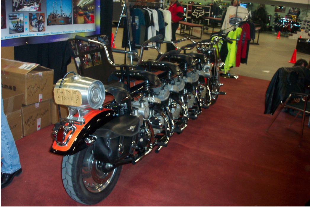
2010 NE Motorcycle Show, Boston MASS

NOW WOULDN'T THIS BE FUN AS A GROUP RIDE?