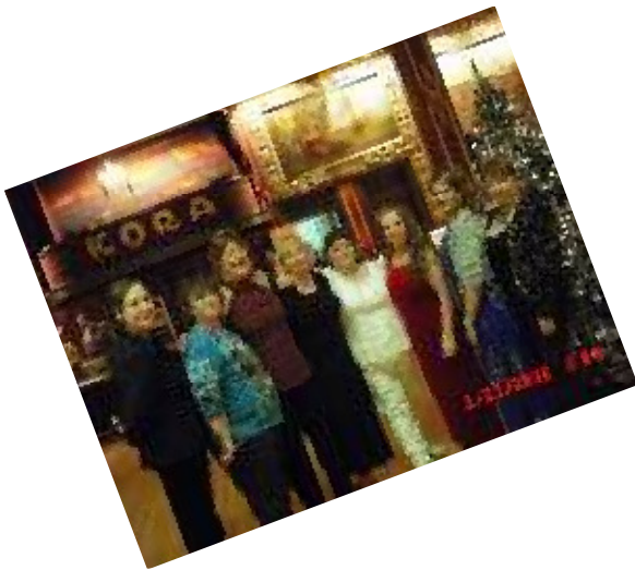
HOLIDAY PARTY FUN

NOW WOULDN'T THIS BE FUN AS A GROUP RIDE?