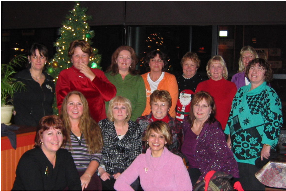
LOH HOLIDAY DINNER AT DAVINCI'S