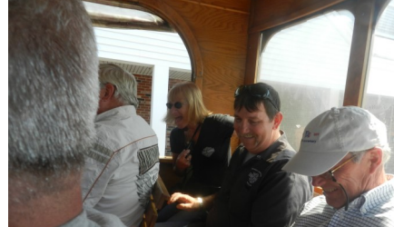
Boothbay Harbor—trolley ride

Don't forget to check the upcoming events below and mark your calendars to join in on the fun!