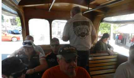
Boothbay Harbor—trolley ride