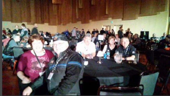
Chapter officers and members at the dinner party followed by live music and dancing