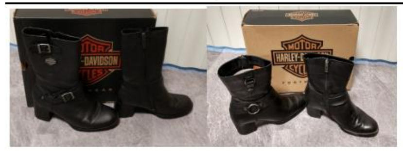
Womens Harley boots size 7 ½ in excellent Womens Harley boots size 7 ½ in excellent condition Contact Sandy Bruno condition. Contact Sandy Bruno at 577-5292 at 577-5292 Asking $75 or best offer