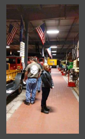
Viewing the history of transportation