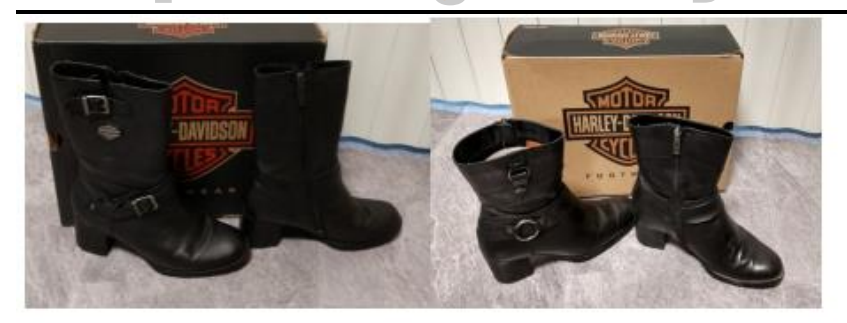
condition Contact Sandy Bruno at 577-5292 Asking $ 70 or best offer