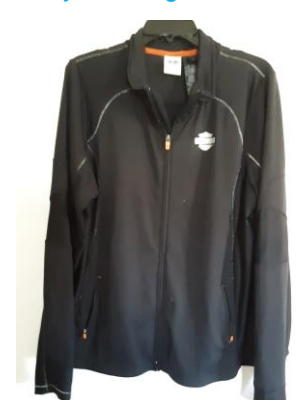
Women's vest. Light weight jacket size 1W and a Men's Mid-Maine HOG jacket size 2XL. Asking $30 each item. Contact Anita FMI.