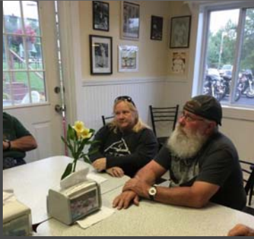
It was a small group but still a good ride to Fast Eddie's in Winthrop for a midweek dinner.